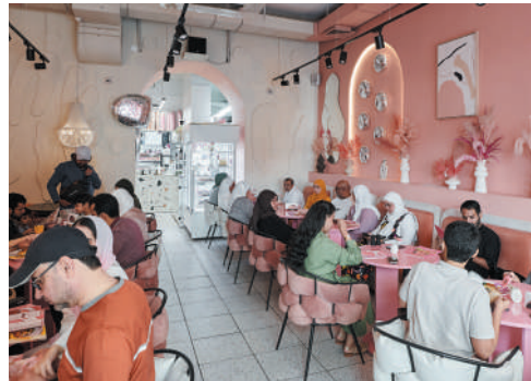
▼ OMG COFFEE

The menu is based on European comfort food with a twist: croissant cubes, cream soup in a small pumpkin, or a burger topped with hot cheddar. More than 30 kinds of homemade cakes and pastries for dessert.