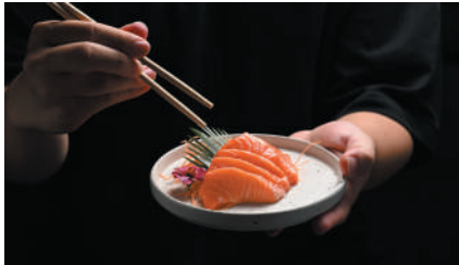
▲ KAPPOU HIROKI ARAKAWA

● Bolshaya Nikitskaya str., 5 GREAT LIST