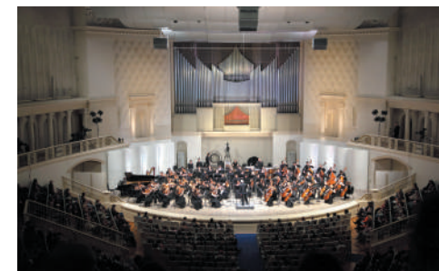
▲ MOSCOW STATE ACADEMIC PHILHARMONIC SOCIETY