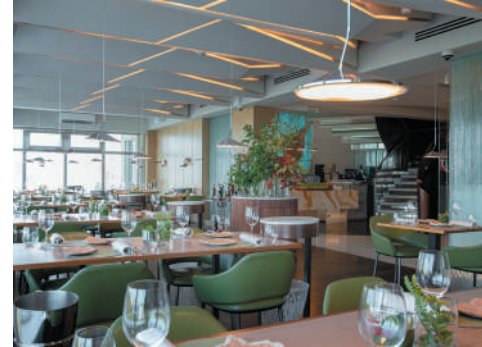
▼ TWINS GARDEN