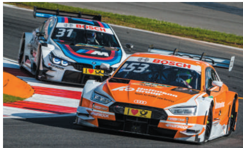
● Nizhniy Susalny lane, 5, bld. 15