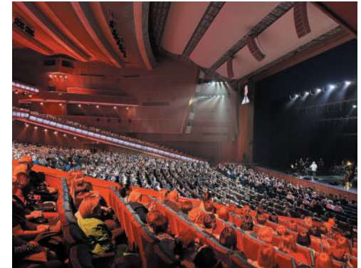
▲ STATE KREMLIN PALACE