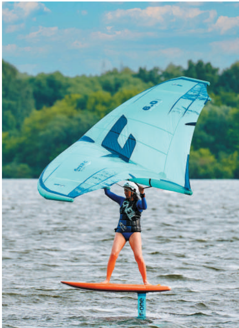
● Karamyshevskaya emb., 13, bld. 13/2