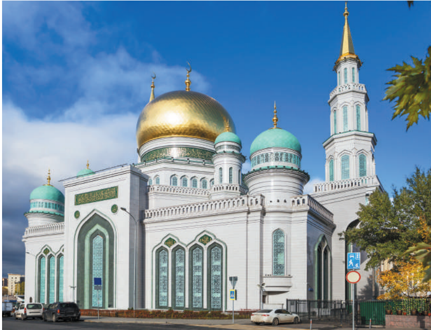
◀ MOSCOW CATHEDRAL MOSQUE