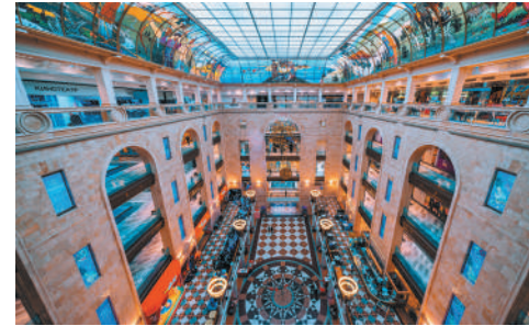
▲ CENTRAL CHILDREN'S STORE