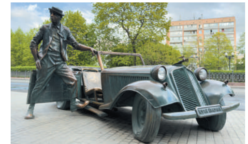
▼ NIKULIN MOSCOW CIRCUS ON TVETNOY BOULEVARD