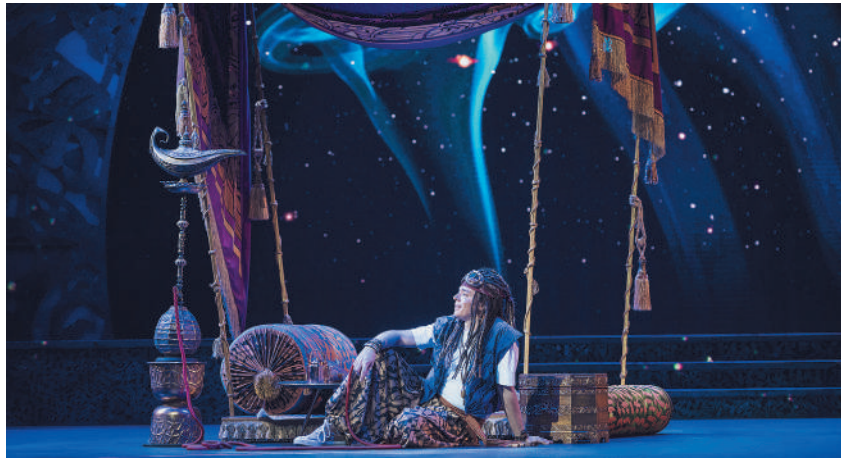
◀ MOSCOW YOUTH PALACE