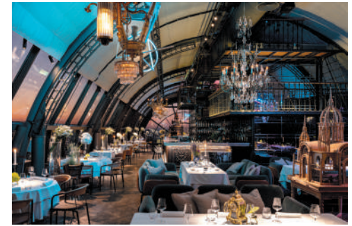
▲ WHITE RABBIT