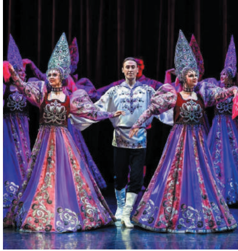
▲ MOSCOW STATE ACADEMIC DANCE THEATER "GZHEL"