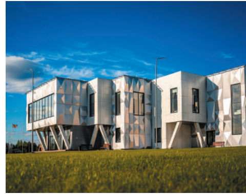
▲ MOSKINO CINEMA PARK