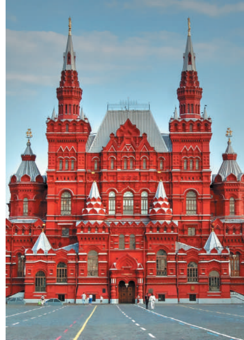
▲ STATE HISTORICAL MUSEUM