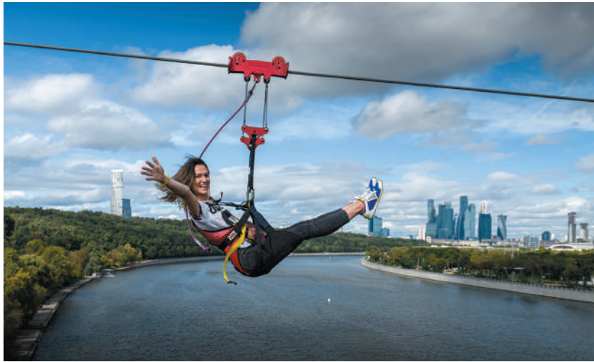
◀ SKYPARK MOSCOW — ZIPLINE ON SPARROW HILLS