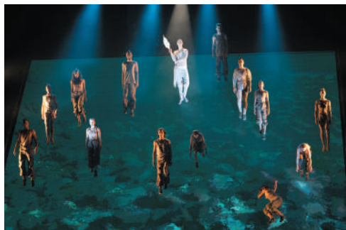
◀ ANTIGRAVITY MULTIMEDIA THEATRE AND CIRCUS SHOW