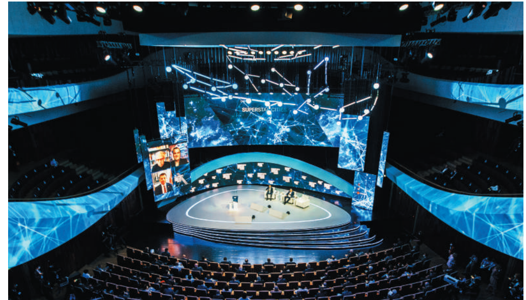
▼ ZARYADYE CONCERT HALL