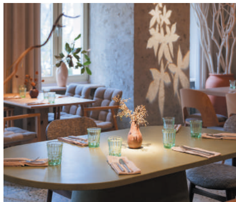
▲ M2 ORGANIC CLUB