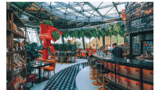
▼ ZARYADYE GASTRONOMIC CENTER