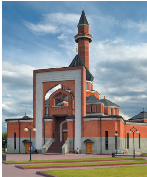
▲ MEMORIAL MOSQUE ON POKLONNAYA GORA