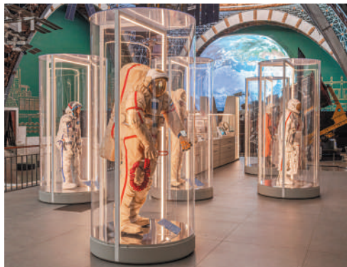
▲ THE COSMONAUTICS AND AVIATION CENTER