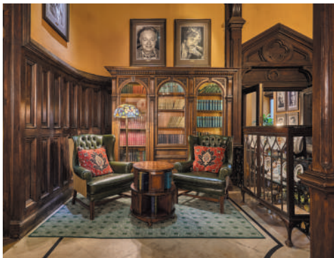
▼ RESTAURANT OF THE CENTRAL HOUSE OF WRITERS