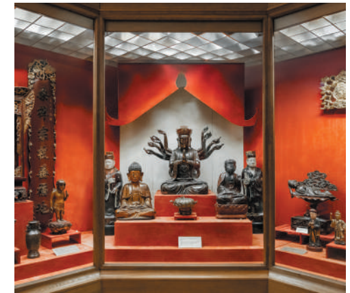
▲ STATE MUSEUM OF ORIENTAL ART