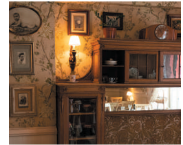
▲ MARI VANNA